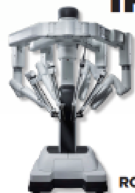
REPLICA DA VINCI XI ROBOT ON SITE!